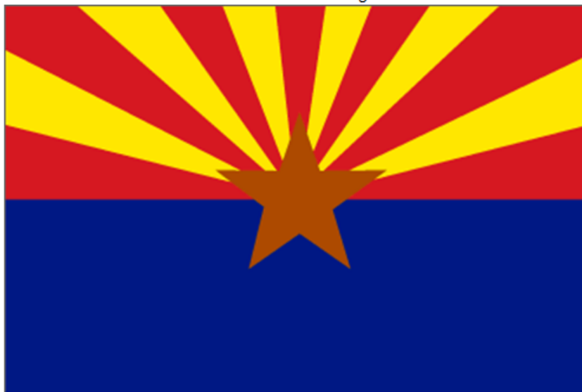
Arizona State Flag

The 13 rays of red and gold on the top half of the flag represent both the 13 original colonies of the Union, and the rays of the Western setting sun. Red and gold were also the colors carried by Coronado's Spanish expedition in search of the Seven Cities of Cibola in 1540. The bottom half of the flag has the same Liberty blue as the United States flag. Since Arizona was the largest producer of copper in the nation, a copper star was placed in the flag's center.